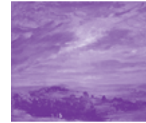
Hampstead Heath Looking Towards Harrow ('5 o' clock afternoon: August 1821 very fine bright & wind after rain slightly in the morning') 1821 John Constable